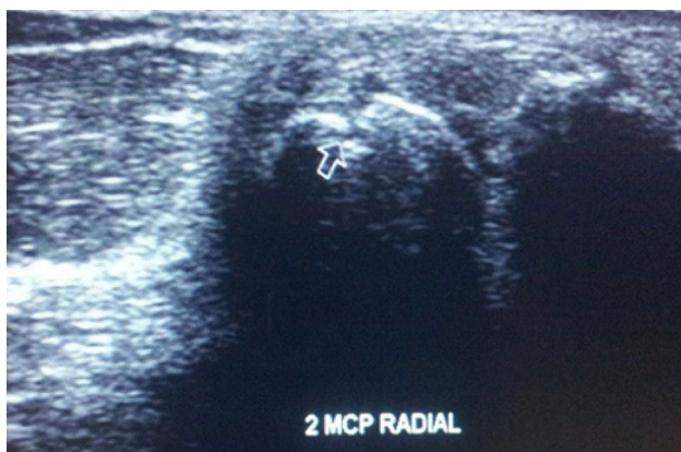
Fig. 3 Radial longitudinal US scan of 2nd MCP joint showing erosion in a FDR