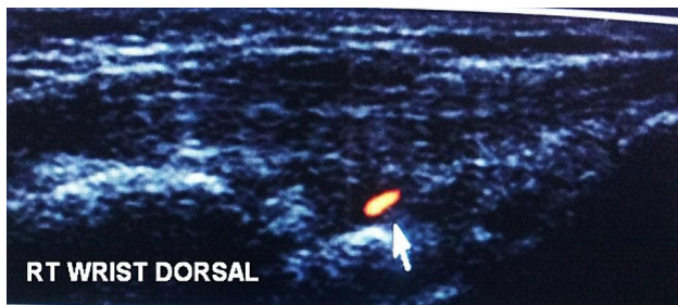
Fig. 2 Dorsal longitudinal US scan of right (RT) wrist showing mild radiocarpal synovitis with PD signal grade 1 in a FDR