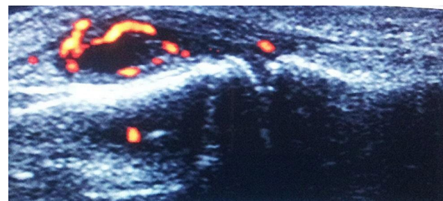
Fig. 1 Dorsal longitudinal US scan of 2nd PIP joint showing synovitis with PD signal grade 3 in RA patient

FDRs: first degree relatives; ESR: erythrocyte sedimentation rate; CRP: c-reactive protein; OPN: Osteopontin; OPG: Osteoprotegerin