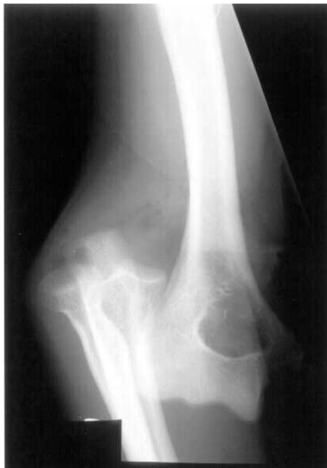
Figure 2 Postero-anterior radiograph of right elbow showing an antero-lateral dislocation

In our patient the medial collateral ligament was found to be disrupted at operation. Thus, the injury had also involved the medial column, dislocating the joint in an antero-lateral direction. Most authors recommend accelerated functional treatment for simple elbow dislocations [7], as long periods of immobilisation have not been found to be of any benefit [8]. Surgical repair of the ligaments has been advocated, but there is little evidence that the results of surgical repair of the ligaments are any better than those of non-surgical treatment [9]. This case highlights the possibility of sustaining an extensive soft tissue damage after a minor injury and illustrates how excellent functional outcome can be achieved with a conservative approach in this situation.