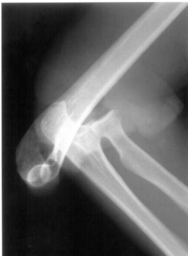
Figure 3 Lateral radiograph of right elbow showing an antero-lateral dislocation