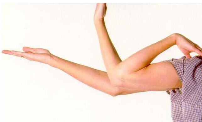
Figure 4 Clinical photograph showing the range of movements achieved on the injured elbow six months after injury